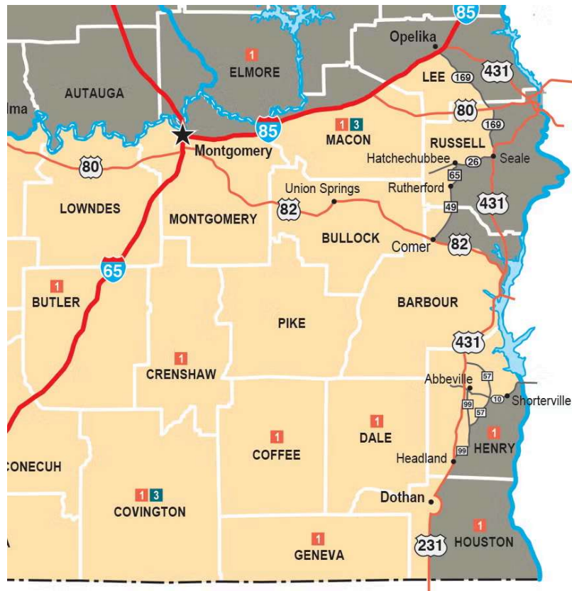
Zone B Eastern Boarder Detailed Map.